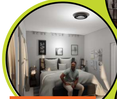
Energy-Efficient Windows Throughout