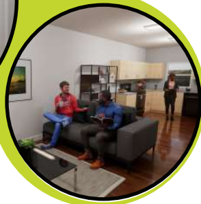
Laminated Hardwood Floors

Contact us to apply or learn more about our Homeownership Program